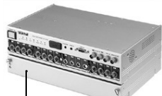
BU-LX1000 Mounting image with 16CH model

* Batteries and battery charger are sold separately. Continuous operation time on battery unit: approx. 7 hours