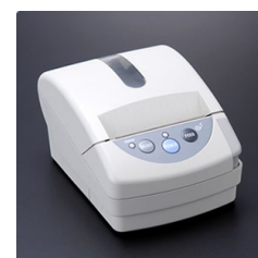
Optional Thermal Printer Model BL2-58SNWJC-SK